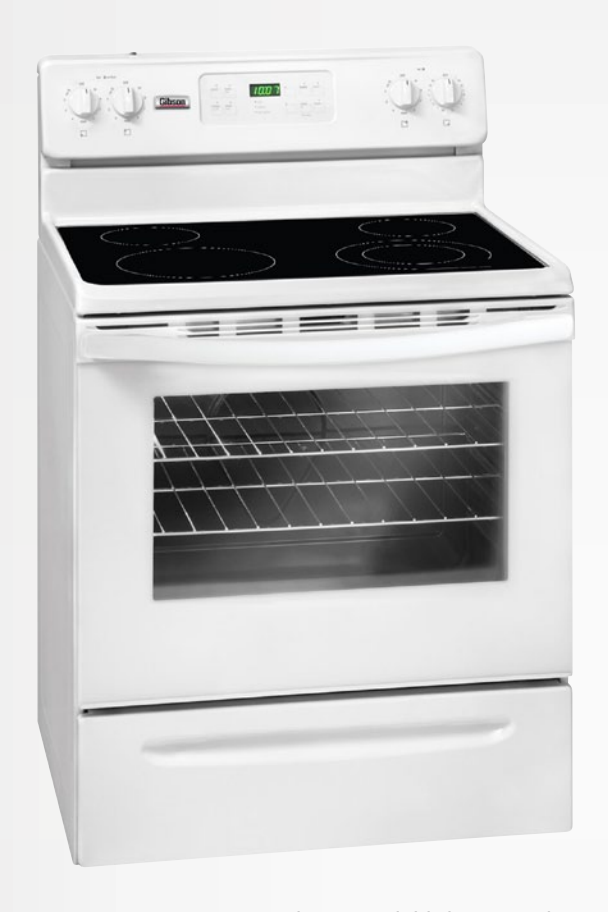
1 - 6/9" 1200/2500 watts - This expandable burner with different wattage allows you to select the size and power you

This Range has an easy to start cleaning function, large glass oven door to allow you to check baking progress and a large storage drawer for your pots and pans.