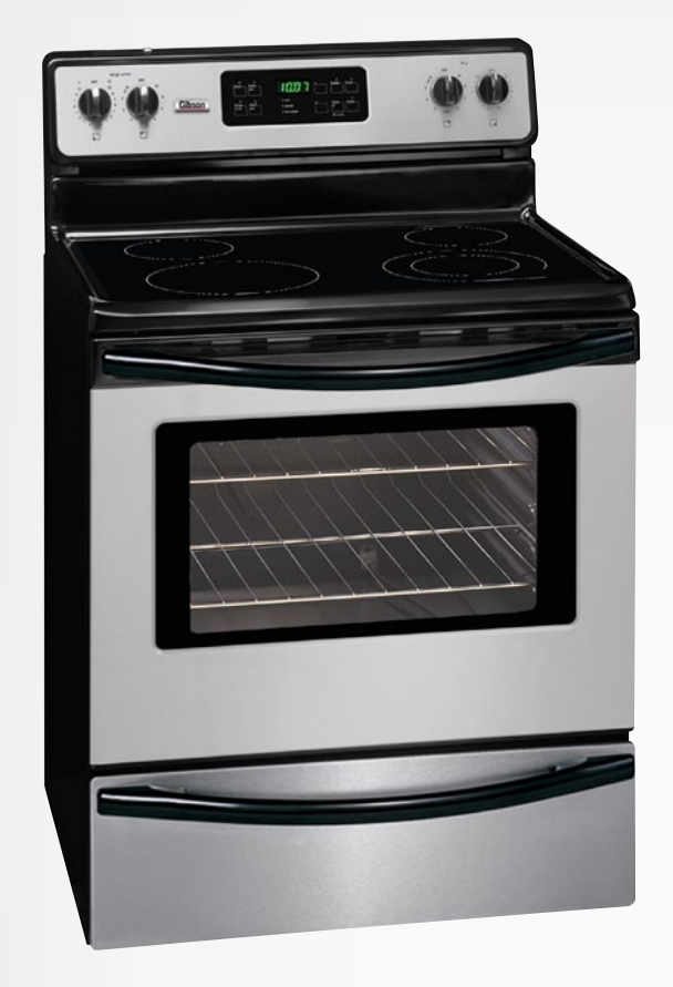
This Range has an easy to start cleaning function, large glass oven door to allow you to check baking progress and a large storage drawer for your pots and pans. The expandable burner with different wattage allows you to select the size and power you need.