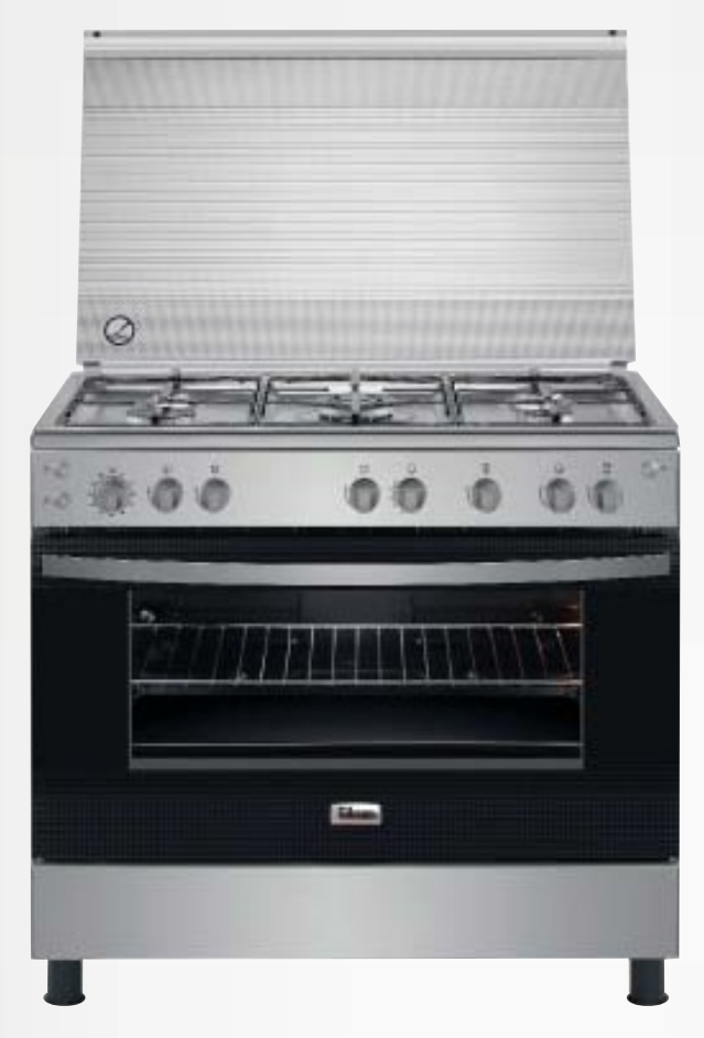
You can have peace of mind preparing your meal on a Gibson gas cooker!